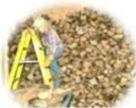
Kelly, next door neighbor stacking