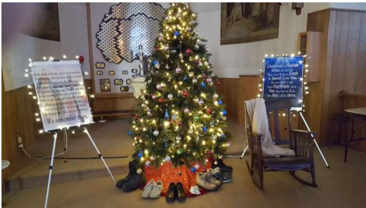
Mater Dei Parish Newport 2019 Memorial Tree remembering all those whom have been called to our Heavenly Father.